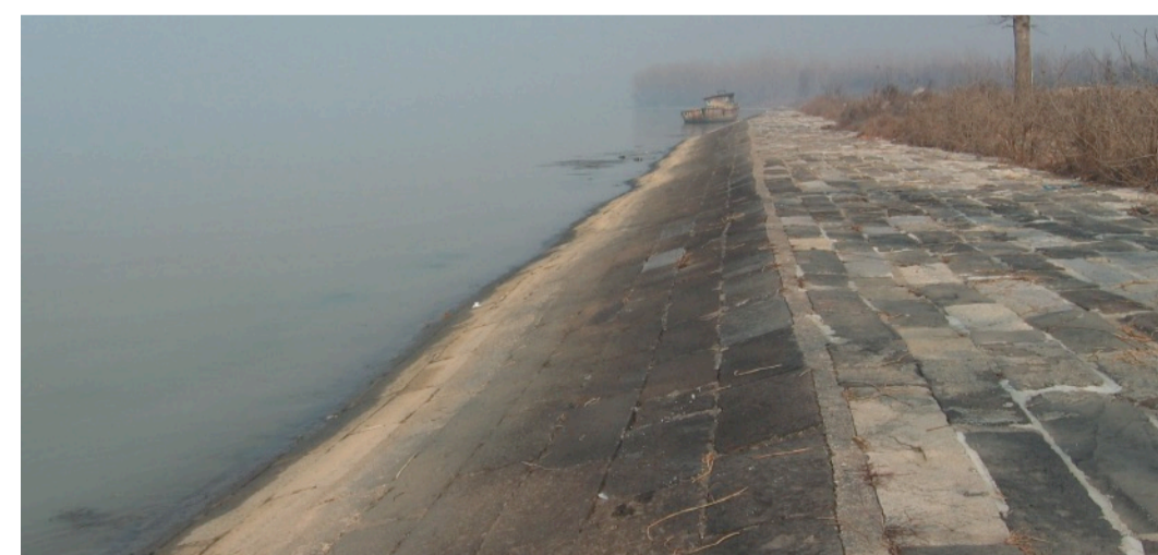
The dam at Hongze Lake is, with regard to canal technology, one of the canal's most important historic sites.

In 1855 the river changed its course to the north, leaving much of the central section of the Grand Canal in a poor state. The canal declined until the centre section was virtually impassible. It was only after the formation of the new Chinese Republic that a programme of canal regeneration was begun. Much of the southern section has been enlarged since the Second World War and is well used, but the northern sections of the canal are impassible.