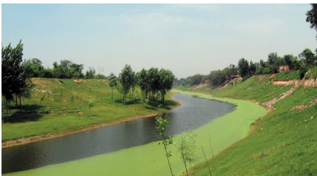
Above: In Cangzhou province just south of Beijing, the canal is no longer in use, though it is proposed to rebuild it to channel water from central China to the drier northern parts.