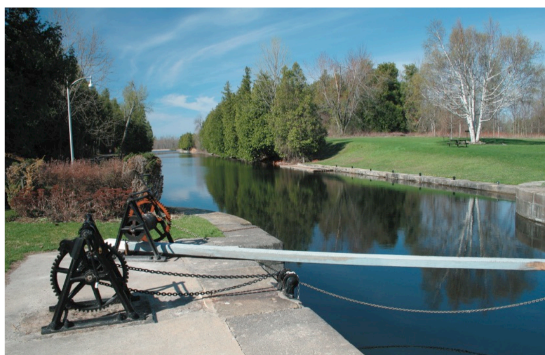
The channel and lock between the Upper and Lower Rideau Lakes.