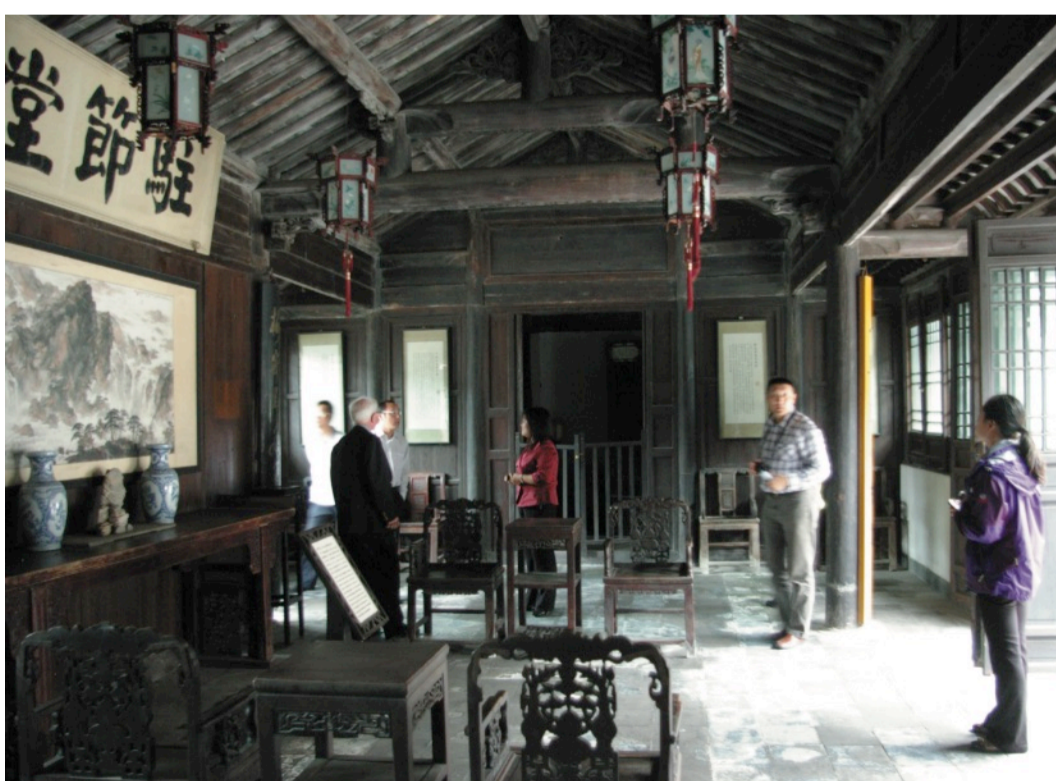
Above: The canal formed part of China's postal system, and once there were thirty postal stations along its banks. Today, just one survives, at Gaoyou. It is preserved as a museum, showing the life of the government officials who controlled the canal and those who worked on it.

The canal's route was influenced by the Yellow River which passes through 'loewes', a very soft rock, creating a large amount of silt. Siltation in the river's lower reaches caused its route to vary dramatically. Prior to 1288, the river followed its present route, but from then until 1855 it turned south east to join the River Huai near Hongze Lake, before flowing into the Yellow Sea. The new river mouth was some 250 miles further south, which gives some idea of the scale of the change. In 1855 it changed again, reverting to its old route to the Bohai Gulf.