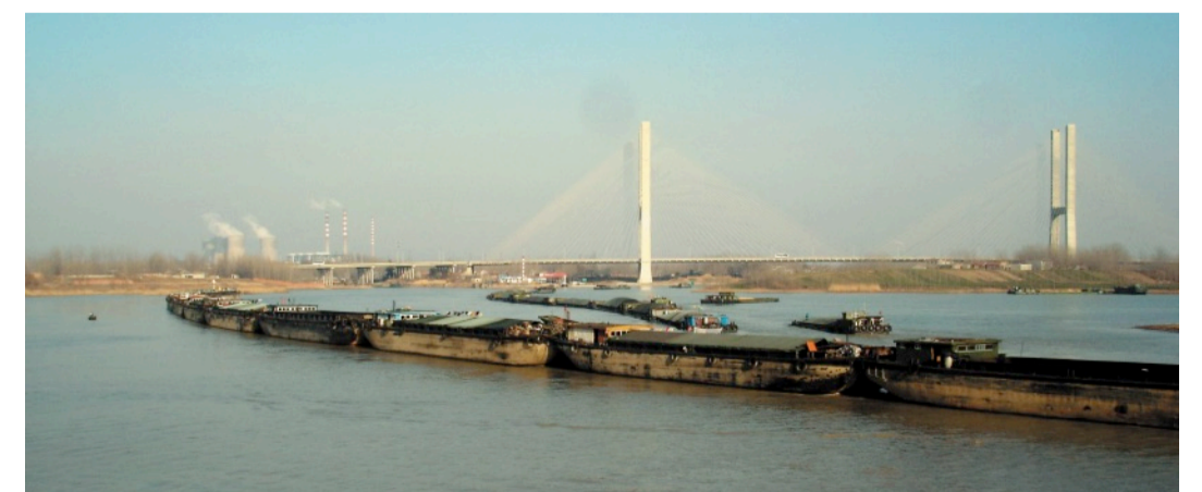
A recent photo of canal boats under way in Huaian province.

http://whc.unesco.org/en/tentativelists/5318/ http://www.absoluteastronomy.com/topics/Grand_Canal_of_China