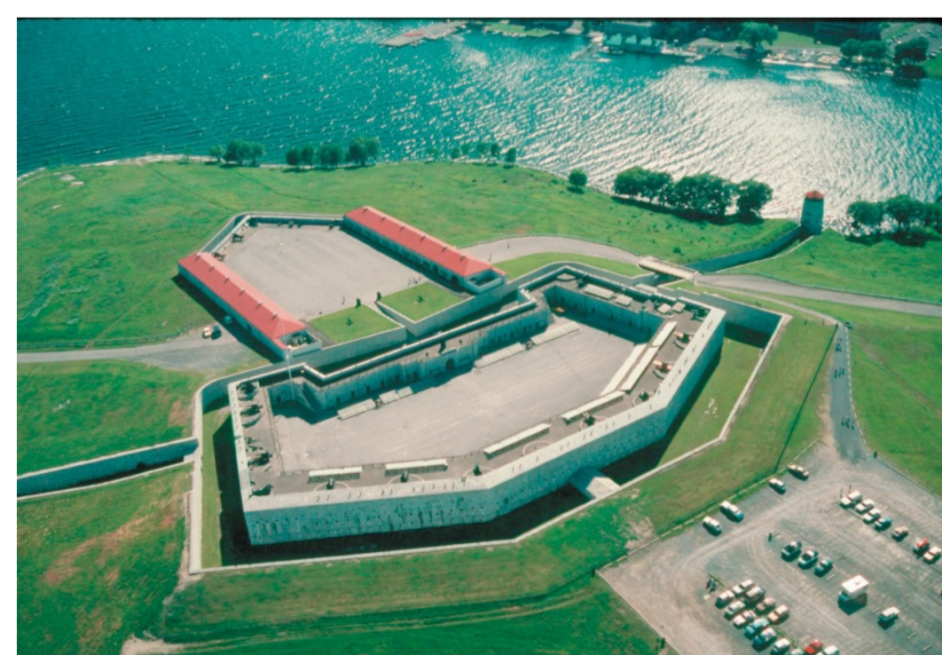
The museum at Fort Henry is a reminder that the canal was built to defend Britain's Canadian colonies from invasion by those based in the new American states to the south.