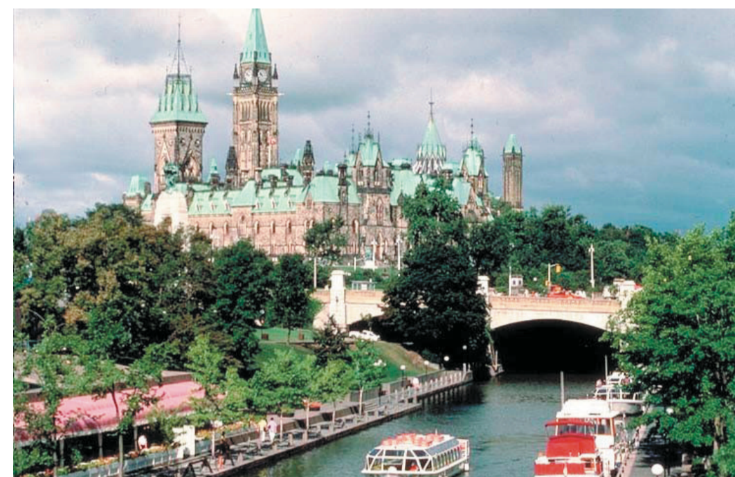
In Ottawa, the canal passes close to Canada's Parliament Buildings.