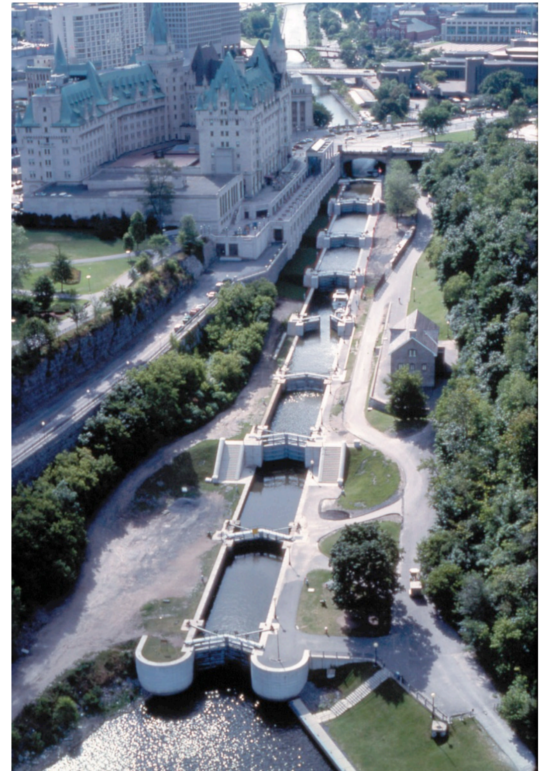
The eight-rise locks in the centre of Ottawa are probably the canal's most impressive sight.

This so-called 'slackwater' system was built by Lieutenant Colonel John By of the Royal Engineers Corp who had been appointed by the British Government in 1826 to supervise the construction of a connection between Lake Ontario and the Upper Canada colony. John By's solution avoided the need for extensive excavations of new channels and called for series of dams which backed up river water to a navigable depth and created a chain of 50 locks. He opted for fewer locks with large rises rather than more shallow locks. Lock rises are up to 4.6 metres. He also built the locks large enough to accommodate the new steamboats. The locks were up to 37.8m long and 9.1 metre wide and this, combined with the high lifts, necessitating the lock walls, gates etc being substantial structures to hold back the force of the water.