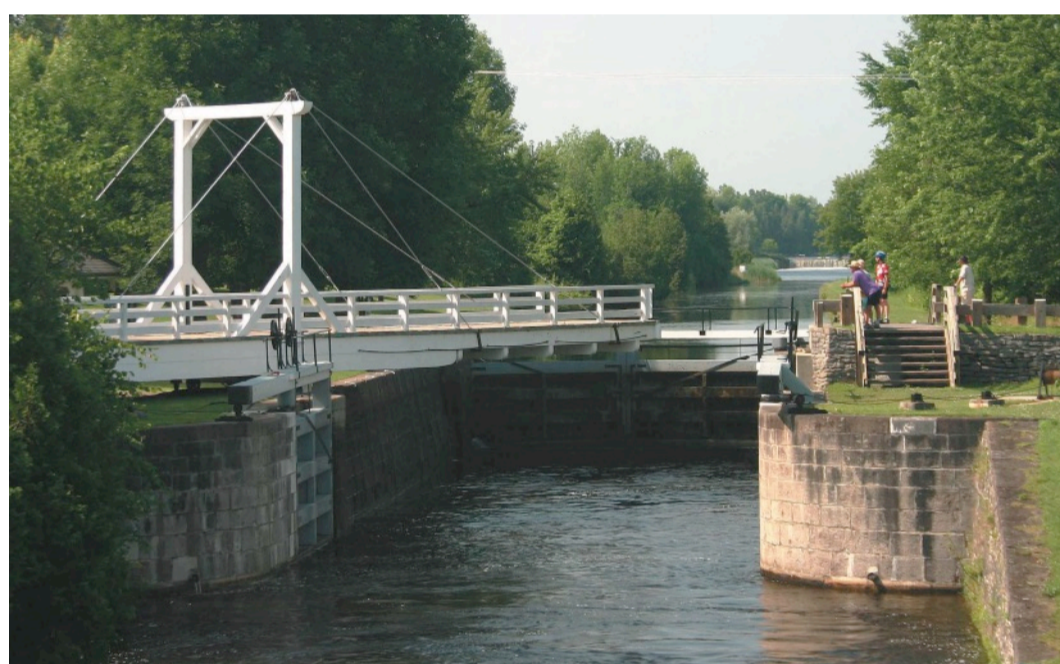
The king truss swing bridge and the lock at Nicholson's give a good idea of the type of engineering to be found on the waterway.

By the mid 19 th century the canal had lost its strategic position but had become a successful commercial transportation system. This success led to a profound impact on the surrounding previously almost deserted region, through the development of numerous small settlements, based on farming, mills and service industries, and one large town at its northern end. Originally called Bytown after John By, its name was changed to Ottawa in 1855 and it became the capital of the new Dominion of Canada in 1867. By the 1870s the canal had been discovered by tourists and a number of resorts were developed in the 1890s and summer cottages appeared in increasing numbers after the First World War. The canal is now used almost exclusively for recreation.