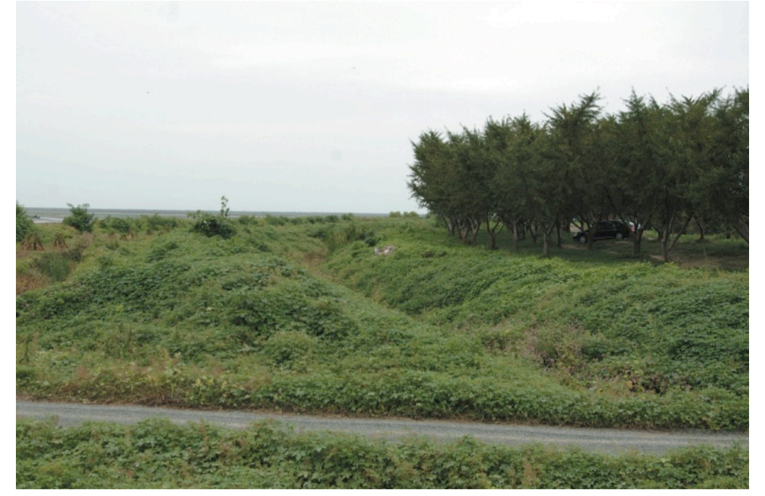
Today, the original canal at Gaoyou, to the north of Yangzhou, is just a ditch, with the modern canal off the photo to the right. In the distance is Gaoyou Lake, one of several lakes in the area which help with flood control, and once supplied the canal with water.

The Grand Canal is possibly the most important factor in the cultural and economic development of China. Over 1000 miles in length, for centuries it joined the rice-growing area of the Yangtze Valley with Beijing, though in earlier times the canal ran on a more westerly route to the old capital of Chang'an. The canal allowed the rice tax to be transported northwards, where it could help to feed the army guarding China's northern border. It also carried other cargoes, allowing goods to be carried north-south without having to go by sea, where boats could be captured by pirates. Because of its cultural importance to China, and because of the development in canal technology during its construction and operation, it is currently being suggested as a World Heritage Site.