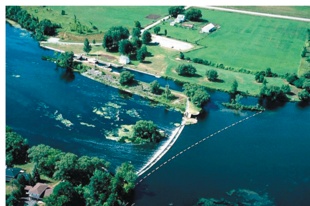
Edmonds lock and weir is fairly typical of the canal, which is based around natural rivers. For much of its route, the countryside is rural and provides leisure opportunities of all sorts.