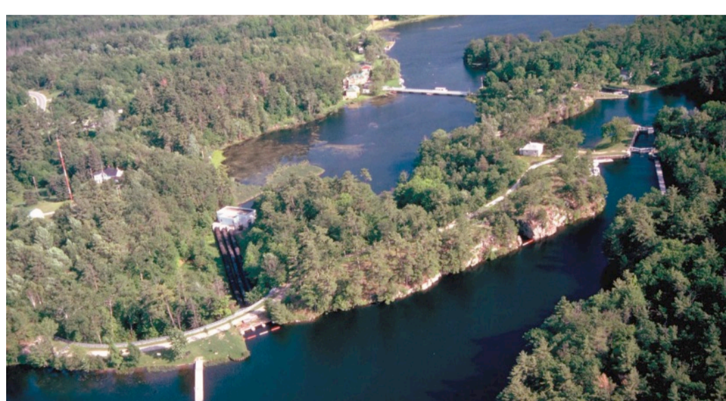
The hydro-electric station at Jones Falls.