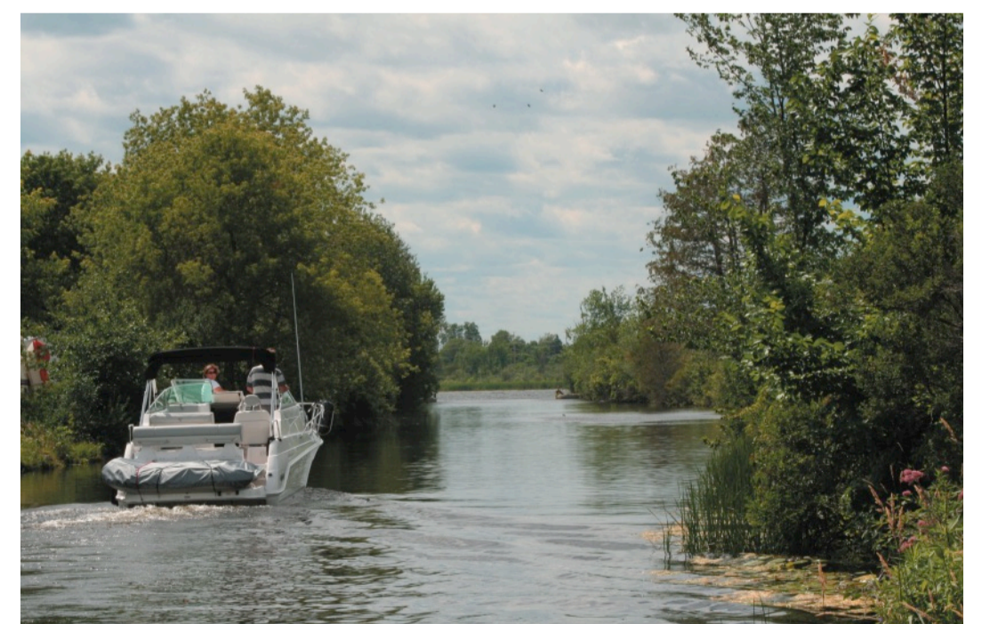
A typical pleasure boat at Merrickville.

http://whc.unesco.org/en/list/1221 http://www.rideau-info.com/canal/